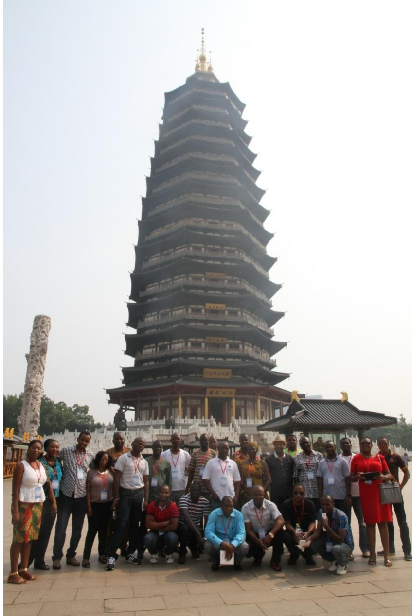
Tianning Temple, Changzhou, China